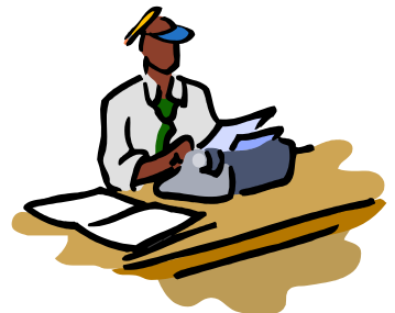
I know I'm forgetting something...

OSRA 627 Madison Ave Grand MI 49503-5315